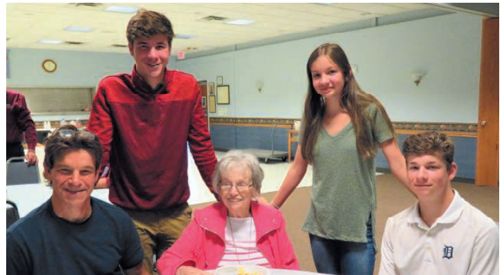
Some of our graduates and their families enjoyed breakfast here last weekend following the 10:15 AM Mass. We wish them all the best in their future endeavors!