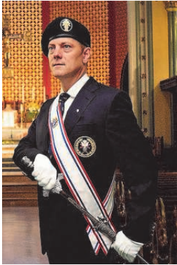
The New Look

The Supreme K of C Council decided at its annual convention earlier this year to modernize the look of Fourth Degree Honor Guards. Gone are the feathery chapeaus, capes and tuxedos, replaced by a blue sports coat, gray slacks and a black beret. The ceremonial swords are being retained.