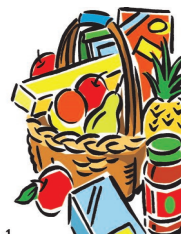
Thanksgiving Food Baskets

Special thank you to all who helped and to everyone who made donations to our Thanksgiving Food Program. We couldn't have done it without you!