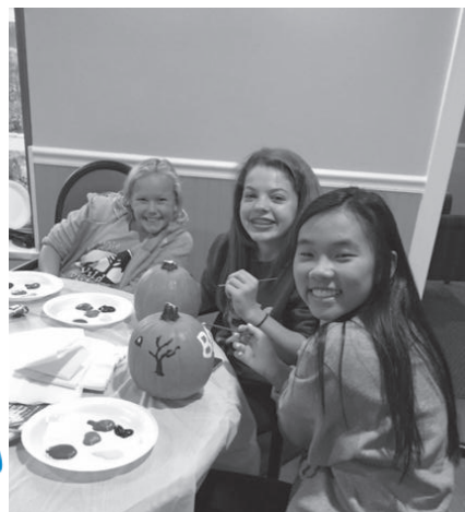
Members of our Youth Group enjoyed their visit to Ashley Court last Sunday visiting with the residents