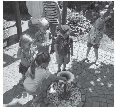
FUN HAD BY ALL